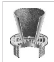
EF-(*) (*) Denotes Strainer Finish (-1, -3 or -50)

F1100-EF Series meets ANSI-ASME floor drain standard A112.6.3-2001