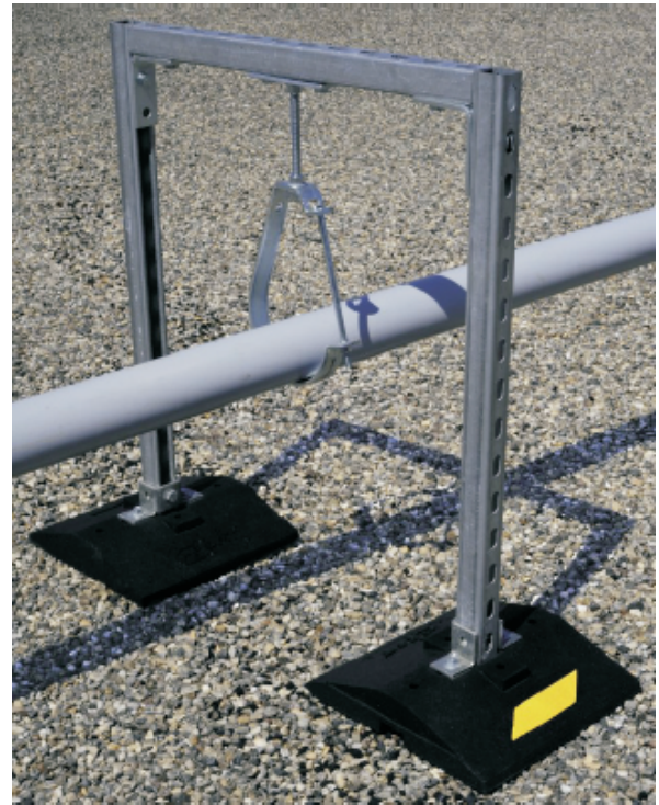
Note: CESW12-2424 illustrated. Pipe hangars by others.