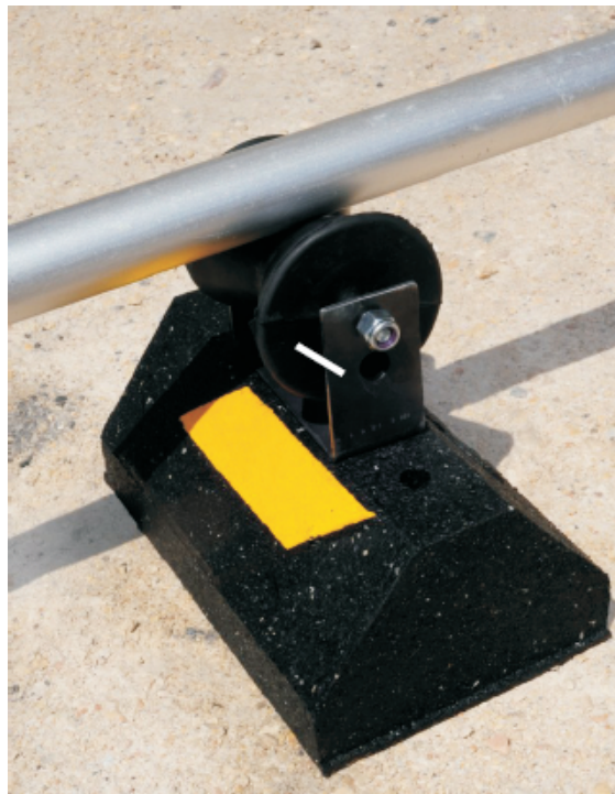
Note: CR10-4 illustrated