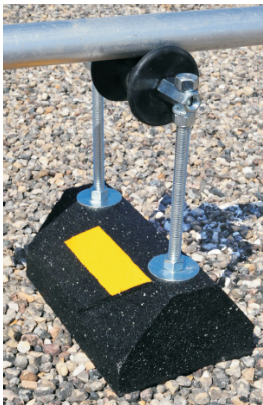
Note: CRE10-8-3 illustrated