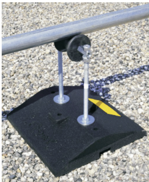
Note: CREW12-12-3 illustrated