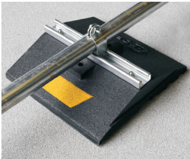
Note: CW12 illustrated. Pipe clamp by others.