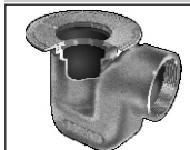
F1120(*) (*) Denotes Outlet Size