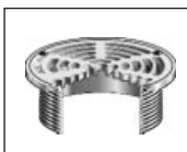
(*)-(**) (*) Denotes Strainer Diameter (5", 6", 7", 8", or 10") (**) Denotes Strainer Finish (-1, -3 or -4)

F1120 Series meets ANSI/ASME floor drain standard A112.6.3-2001