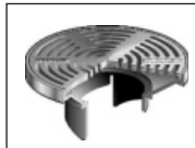
F1340-TA-(*) (* Denotes Strainer Finish (-1, -3 or -4)

F1340 Series meets ANSI/ASME floor drain standard A112.6.3-2001