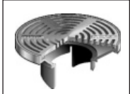
F1340-TA-(*) (*) Denotes Strainer Finish (-1, -3 or -4)

F1350-Y-36 Series meets ANSI/ASME floor drain standard A112.6.3-2001