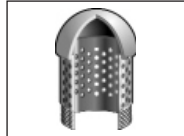
W-31-PERF and F1830-PD-3