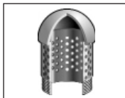
W-31-PERF and F1830-PD-3